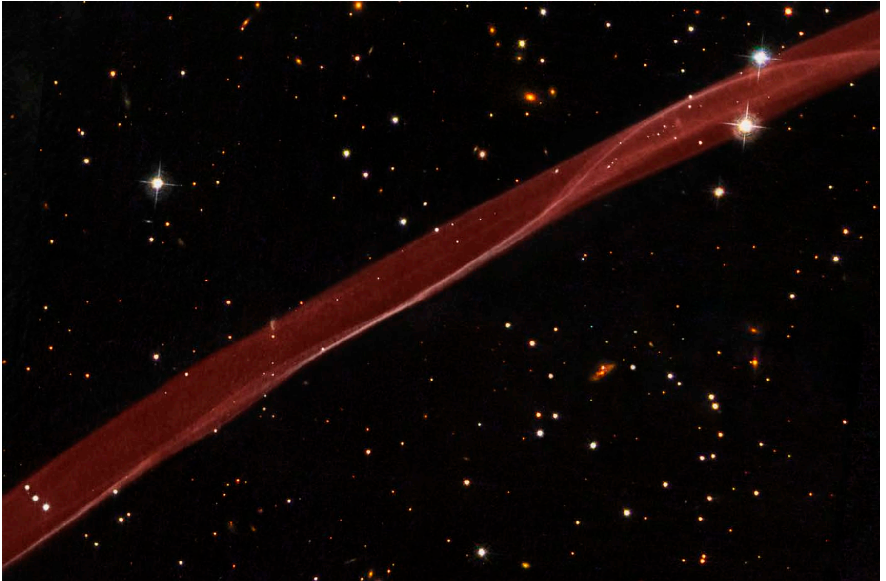
Supernova Remnant SN 1006